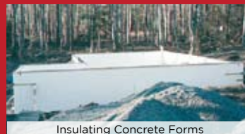
Insulating Concrete Forms